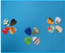
ABOVE: The Green Team transforms used gift cards into guitar picks for local artists.

Now that the holidays are over, you're probably wondering what to do with all of your used gift cards. While some stores and restaurants take them back to be reloaded, many do not and the cards just end up being more plastic waste entering our landfills.