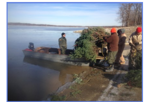
ODNR staff place Christmas trees in area lakes for wildlife habitat.