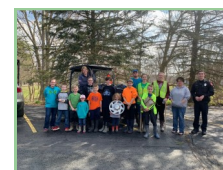
Members of Village Varieties 4-H Club picked up litter in North Benton during the 2019 Great American Cleanup.